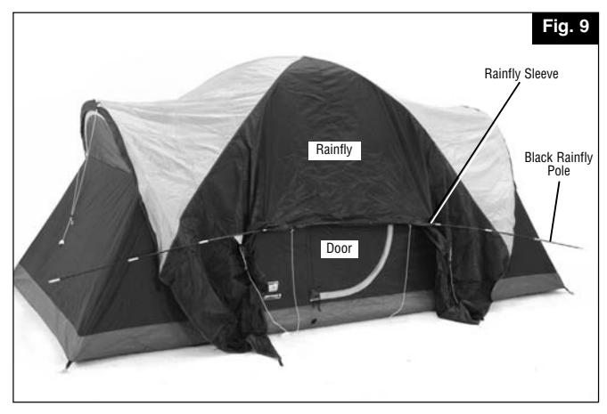
(continued on other side)